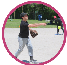
Play adult softball