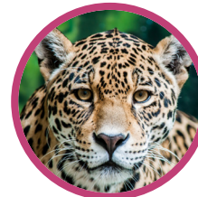
Visit the Toronto Zoo