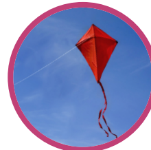
Fly a kite in the park