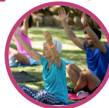
Try yoga or stretching