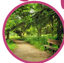
Discover a new trail